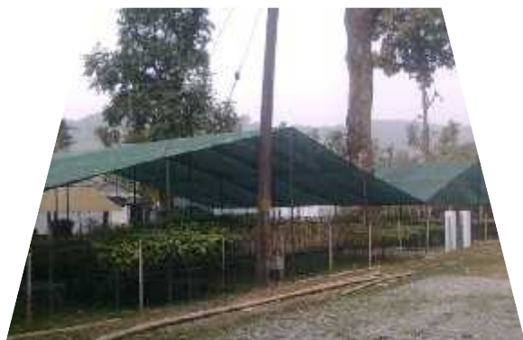
Medicinal plants Nursery in north bengal forest dept.

(SMPBs) and Capacity Building Project Sanctioned to 21 State Horticulture Missions (NHMs) across the country were also covered. Based on the AFC's reporting, the Board was able to withhold release of second installment to the tune of more than Rs. 250 million due to lack of proper utilization of the first installment released by NMPB/SMPBs. The consultancy fee for the assignment was in the order of Rs. 28 million.