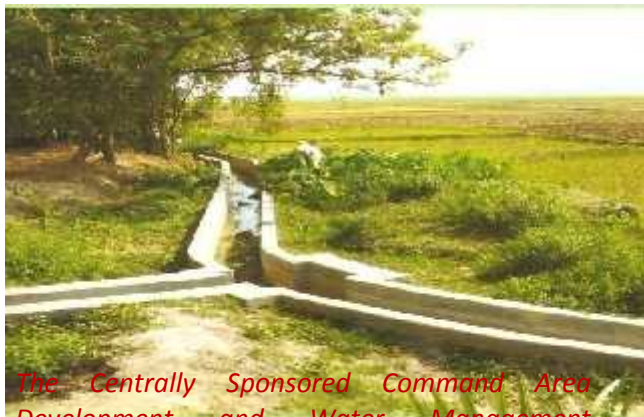
The Centrally Sponsored Command Area Development and Water Management (CADWM)

Program aims at enhancing agricultural production and productivity in irrigated commands by judicious and equitable distribution of the available irrigation water with active involvement of farmers through participatory irrigation management.