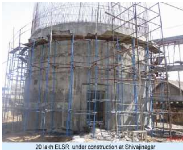
20 lakh ELSR under construction at Shivajinagar

The project aims at enhancing the delivery efficiencies of the urban local bodies in terms of affording better facilities to the people on a sustainable basis so as to ensure better living