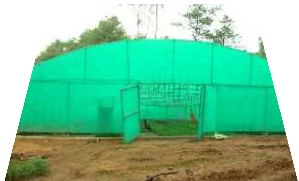
Nursery of medicinal crops in Nagpur

Garden, Training and Work Shops, Production of Quality Planting Material and Development of infrastructure for Processing/ warehousing (123 No.). Like-wise 100 Promotional Projects assigned to Non Government Organization were also evaluated.